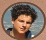
BLESSED CARLO ACUTIS MAY 3, 1991 - OCTOBER 12, 2006