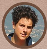
BLESSED CARLO ACUTIS MAY 3, 1991 - OCTOBER 12, 2006